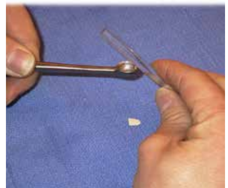
Figure 3 – Testing the Sharpness of a Curette Cutting Edge

Sharpness: Using a plastic (acrylic) test rod, the curette should cut lightly without slipping (see Figure 3).