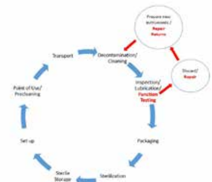
Figure 1 – Instrument Use Cycle

Function testing must be performed consistently, so instruments exhibiting